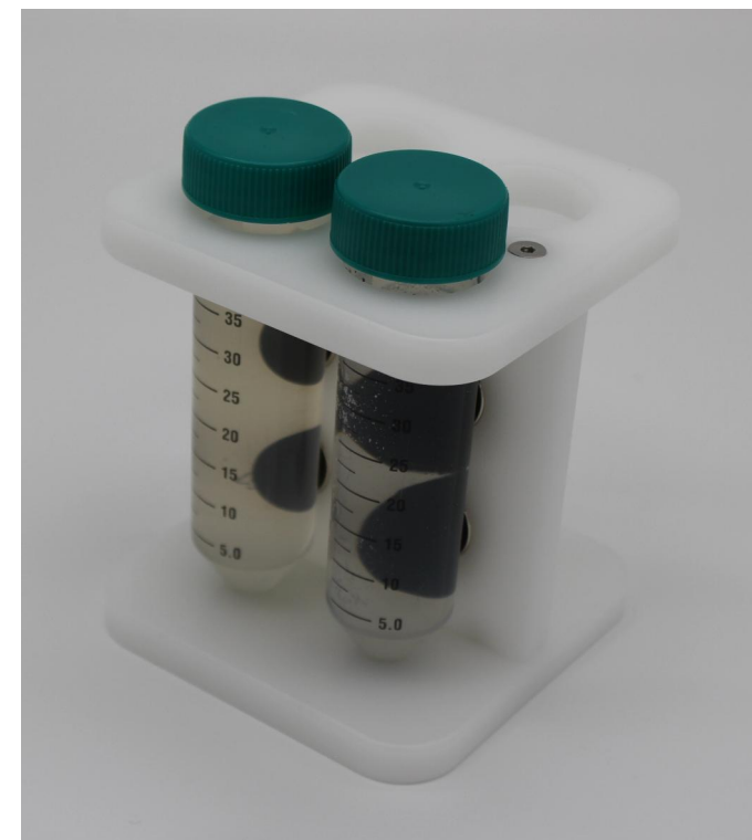
Figure 1. MM-Separator 50 P with two 50 mL tubes. Dimensions: 11 cm x 12 cm x 11 cm. Weight: 0,452 kg

MagSi beads typically collect from the solution to the side of a 50 mL tube between 10 seconds and 1 minute (depending on the type of beads and application).