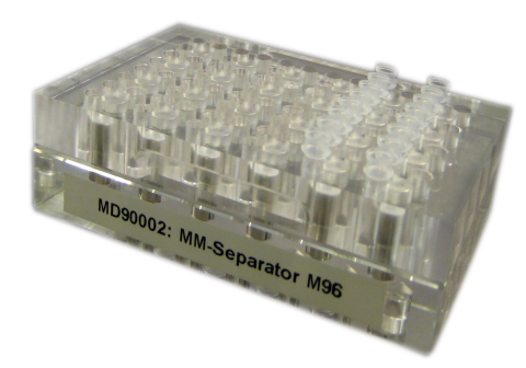
Fig. 4: MM-Separator PCR strip adapter. Dimensions: 12.8 cm x 8.6 cm x 1.0 cm. Weight: ±0.1 kg

Strong magnetic field. Before working with the magnets, take appropriate safety measures. Keep the magnets away from ferrous materials, and magnetic media like computers, videotapes, credit cards etc.