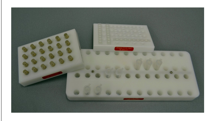
Fig 4: POM versions of the manual separators

bottom and easy supernatant removal. The product is suitable for U- and V-bottom shaped 96 well microplates and for most PCR plates, skirted or semi- and non-skirted.